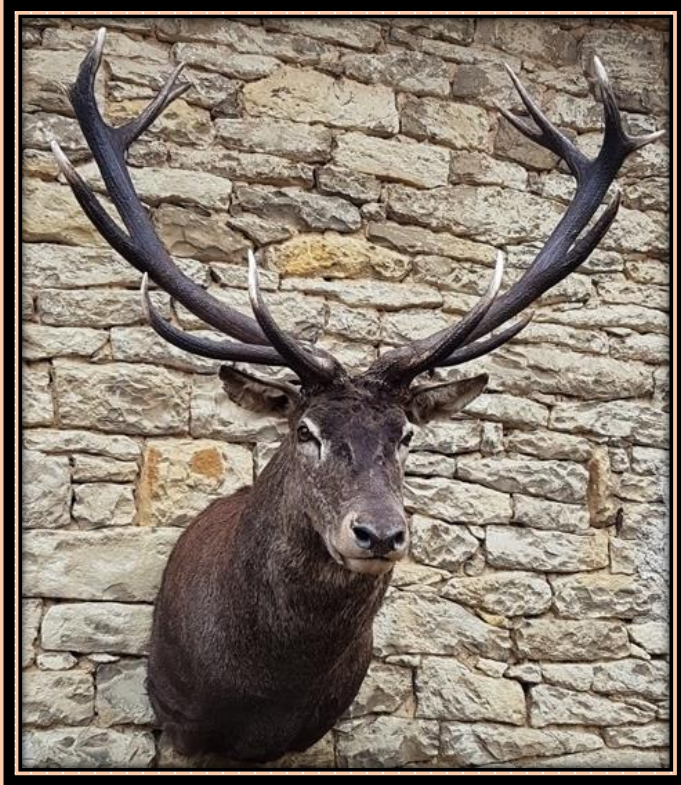
Red stag prepared by taxidermist our partner

Preparation of docs, packaging and shipping to your address: based on number of trophies and weight we will work up a quote.