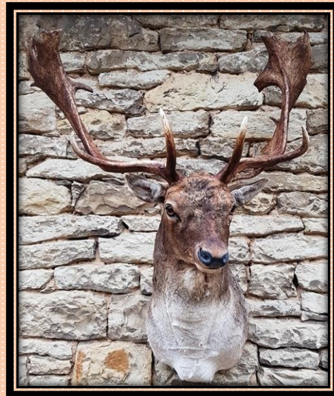
Fallow buck prepared by taxidermist our partner