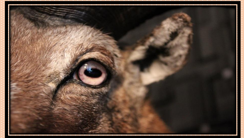
Detail of mouflon prepared by taxidermist our partner