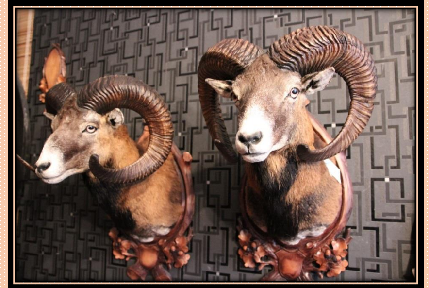
Mouflons shoulder mounts by our skilled Czech taxidermist